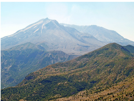
Major volcano that erupted in 1980