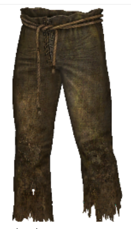
(adj.) old and torn ([破烂, Pòlàn] [andrajoso]) synonyms: rough, battered, dilapidated