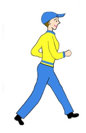
(v.) to walk back and forth in a small area ([徉 Yáng])

"I ____ed in front of the principal's office."